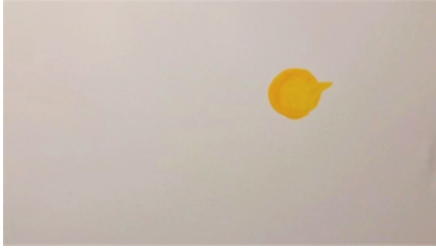
1. Head and beak

Paint your bird! Work in sections by adding the shapes of the bird and blending each new section with the last. To go in the same order as Nicoletta, follow these steps from the video: